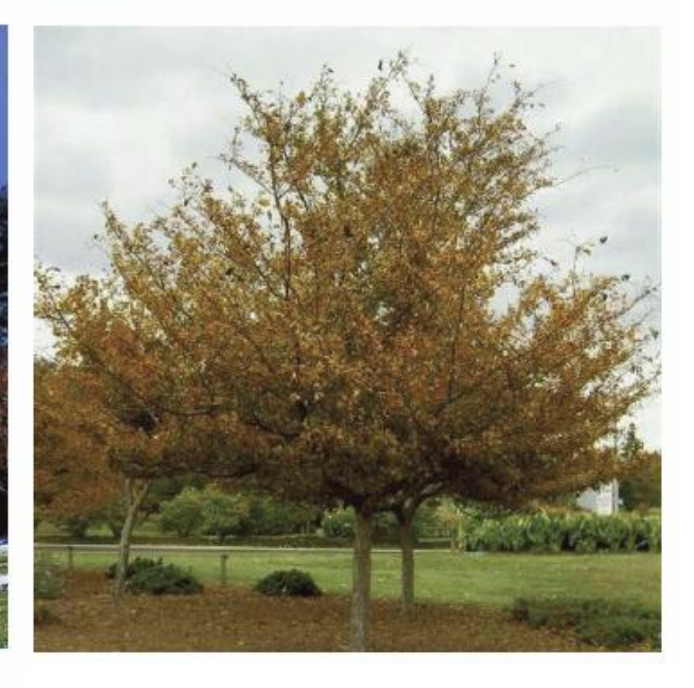
Crataegus viridis 'Winter King'